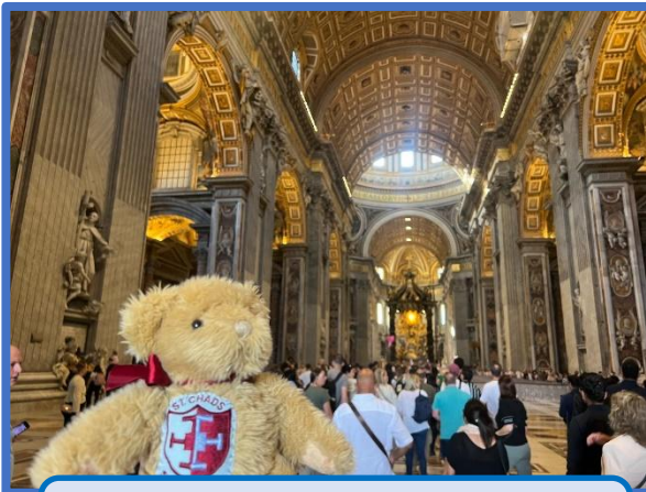
Inside St. Peter's Basilica.